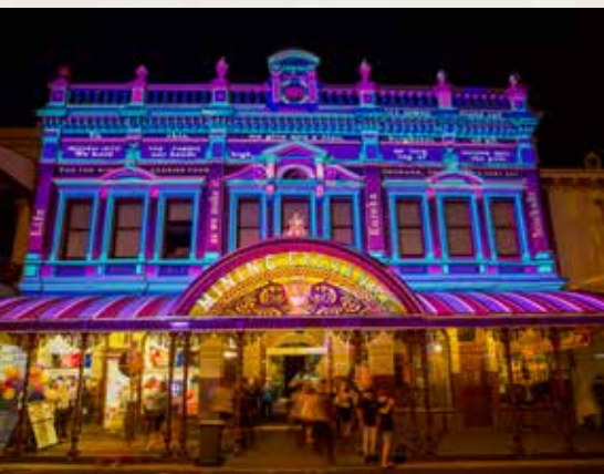
2017 Poetic Program

Australian Poetry, Byron Writers' Festival, City of Sydney, Electric Canvas, LendLease, Melbourne Writers' Festival, Mirvac, Rex, Royal Botanic Gardens Sydney & Victoria, Sculpture by the Sea, S & J Media, Sydney Olympic Park, TfNSW, Waverley Council