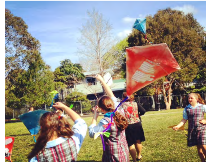
Poems on kites Mt. St. Thomas Best School Installation, 2014